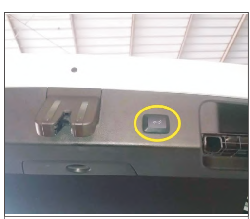
20. \ \mbox{In} the tail door trim stiletto installation we switch button