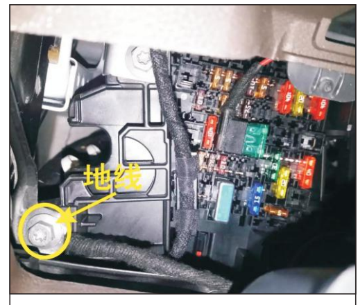
8. Connected to ground