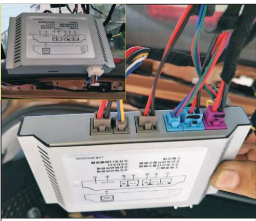
18. The hole line, power line, electric line plug according to the color of a pair of control box