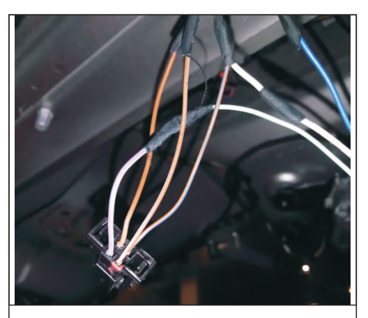
16.\, \mbox{Unplug} the seat in the car door lock, the seat of our tee adaptor