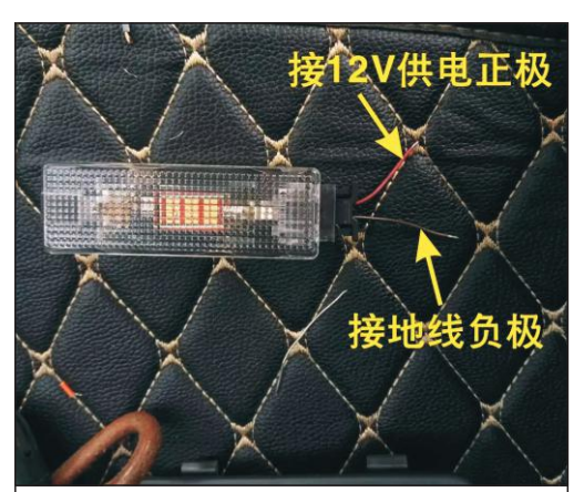
13. In our central control box left out two lines of the anode after the lights (in the trunk) anode, cathode