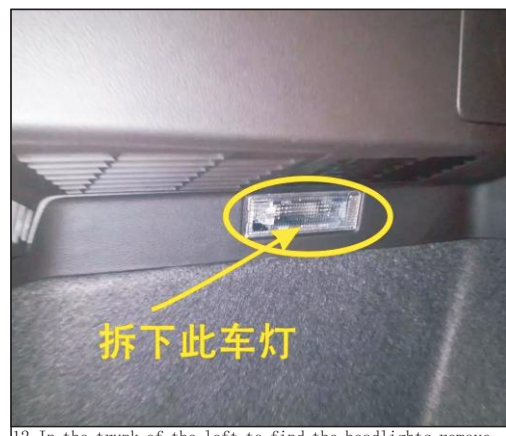
12. In the trunk of the left to find the headlights remove the lights, the original light red, brown line cut, one end of the control box out of the two yellow, and blue lines (pictured), the other end of the package with tape