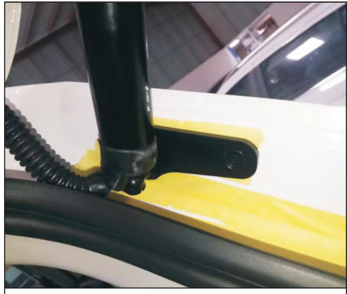
2. Remove the original car right bracket, installation we lower bracket