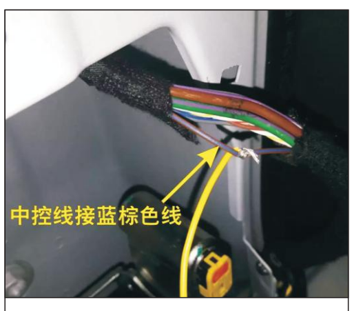
11.0 \mathrm{ur} yellow lines to central pick blue and brown