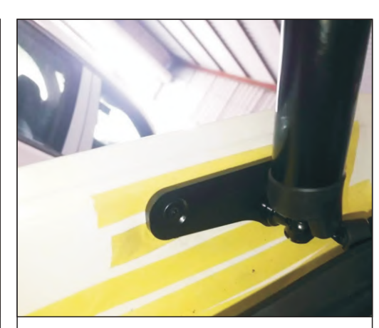
3. Remove the original car bottom bracket, installation we lower left bracket