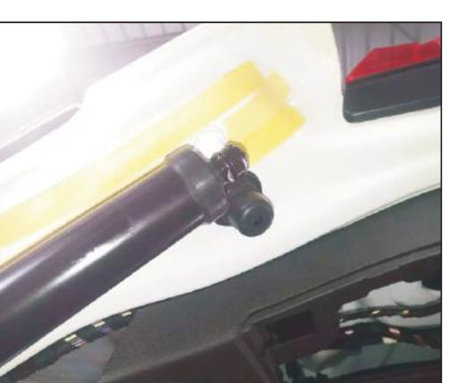
1.In the original car ball head instal led our poles (or steps)

In order to facilitate your installation, please read the instruction manual of the product carefully before installation; care should be taken to protect the surface of your car and prevent scratches during installation. Please check regularly that all accessories connected with the car are loose to ensure safe use.