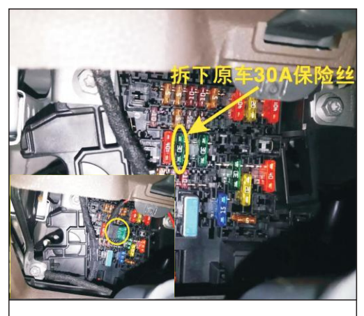
6. Remove the original car 30 a fuse plug, plug in our power plug