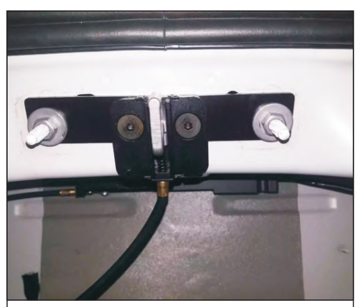
14.\,\mathrm{Remove} the original lock buckle, install our electric lock