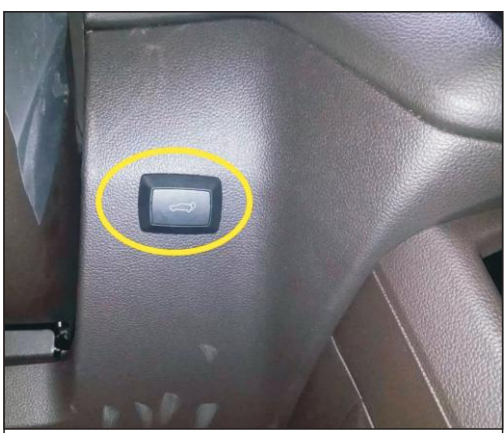
9. In the main drive side before remove the plaque stiletto installation dedicated switch