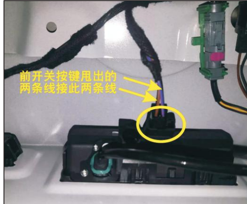
17. Back in the car door for the saddle, the main switch before driving out two lines, respectively by the seat of the two lines