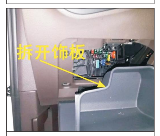
5. Remove the trim at the bottom of the main driving, find out the power