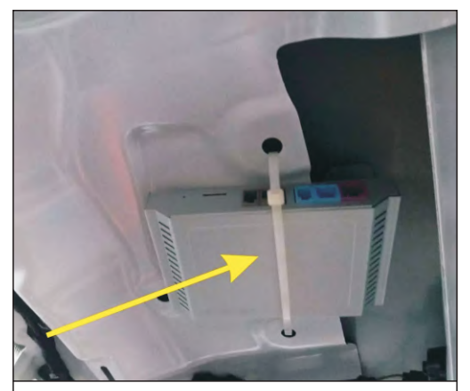
19. Installed as shown, the central control box, with our company 3 m glue and cable tie