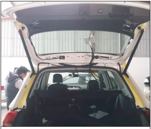
5. Strut installation is complete