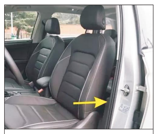
10. In the main drive belt B column trim place apart, find the control